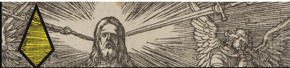
The Last Judgment, from The Small Passion Albrecht Dürer (German, 1471-1528), c. 1510 Metropolitan Museum of Art, New York

© J. S. Paluch Co., Inc. Excerpts from the Lectioary for Mass © 2008, 1998, 1997, 1986, 1970, CCD. All rights reserved.